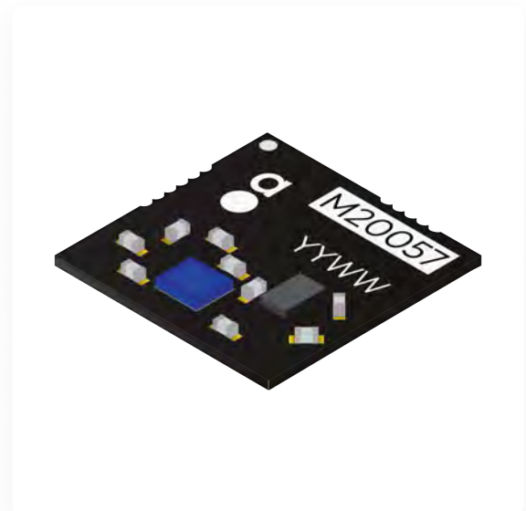
M20057-1 View Product