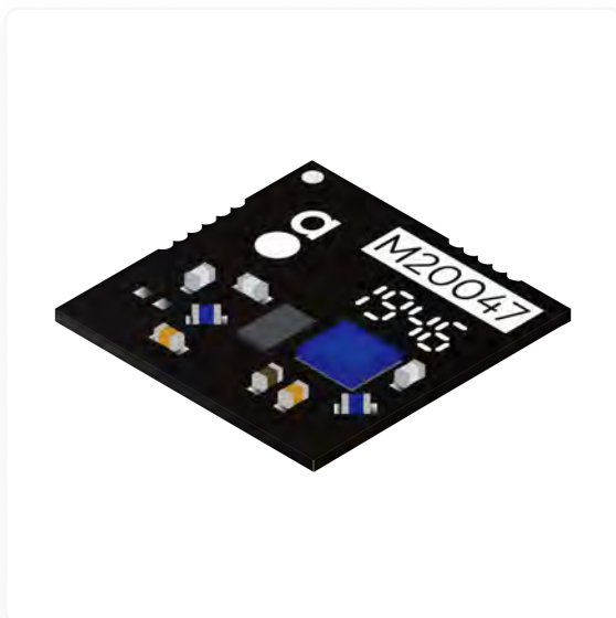
M20047-1 View Product

Both modules have in-built LNA and SAW filters, enhancing connectivity and reducing interference of other components such as those in e-scooters and e-bicycles. The M20057 model has reversed SAW and LNA positions, and provides a simple integration process for low-power GPS asset tracker designs. Find out more by visiting the M20047-1 and M20057-1 product pages.